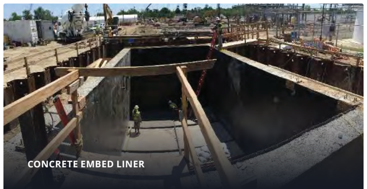
CONCRETE EMBED LINER