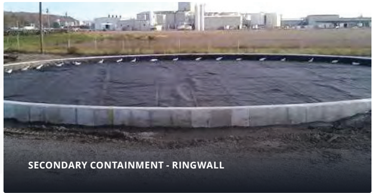
SECONDARY CONTAINMENT - RINGWALL