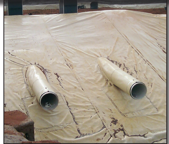
Secondary Containment - Installation of HDPE ringwall liner in a petrochemical facility.

Geosynthetic crews for US Fusion are ready to supply and install HDPE, PVC, rubber or exotic containment liner systems for your team for many applications including: mining, oilfield (frac ponds, pads, waste ponds, etc.) industrial waste containment pill protection, concrete protection and many more.