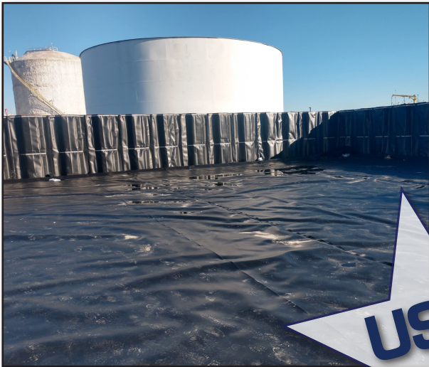
60 mil smooth HDPE liner