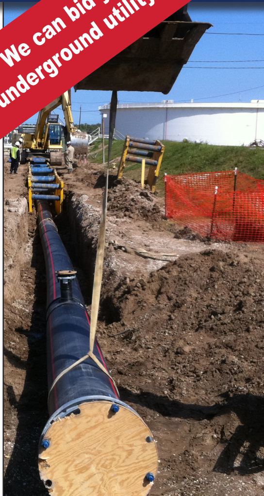
FM CL200 firewater system complete installation - USF replaced a firewater system at a Louisiana refinery with all new HDPE firewater piping.

We can bid your entire underground utility package