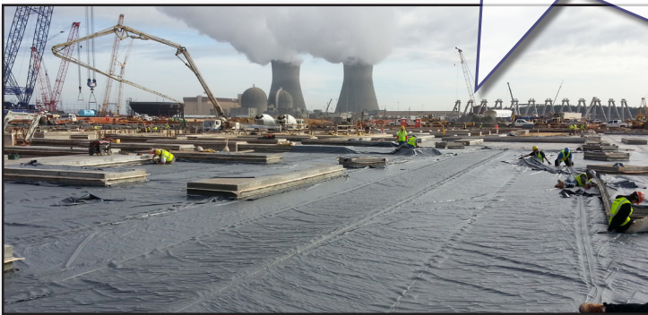
Cooling Tower Foundation Liner: 340,000 sf of PVC containment liner installed by USF.