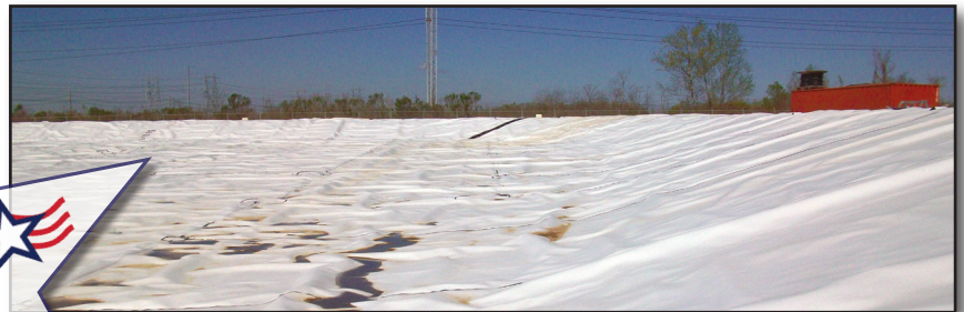
Pond Liner in a petrochemical facility