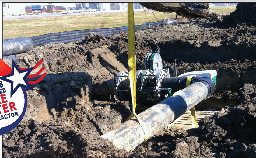
Utility Piping - 2,600 LF of various size HDPE pipe HDD drilled under a state highway. Installed, fused, tested & pigged by USF.